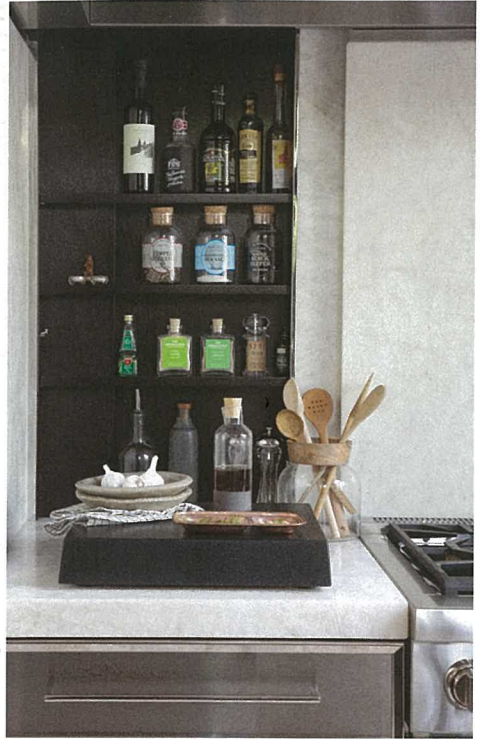
Kitchen overall To light the voluminous space, tiny pendants supplement I-beam fixtures, part of a new collection that Mick De Giulio designed for Tech Lighting. Cabinet A 4-inch-deep niche hidden in the backsplash keep oils and spices at hand by the range. Drawer Slim island drawers hold serveware. French Gien dinnerware speaks to the home's lodgy vibe.